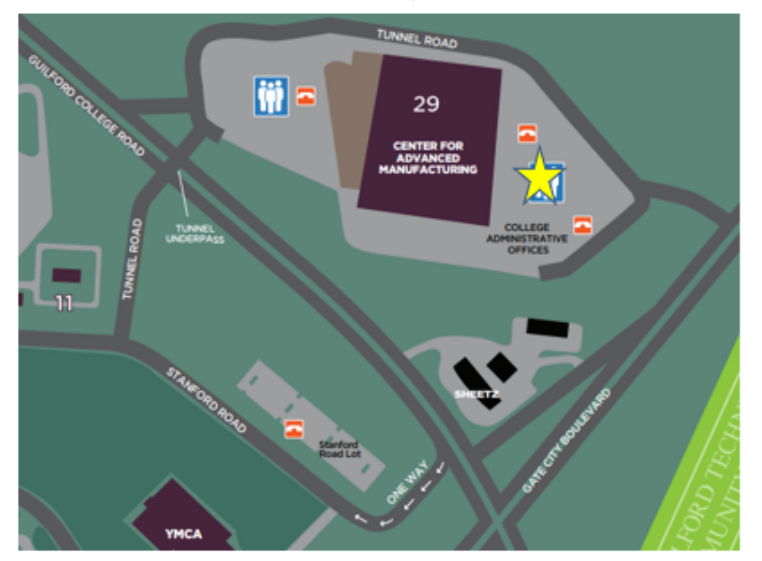
GTCC Center for advanced manufacturing (CAM) 6012 W. gate city Blvd. Greensboro, NC 27407 Park at yellow star front of <u>building</u>