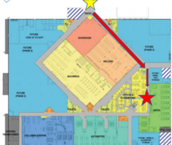
Room 1536. Red star approximately.

Come in front door, walk down hallway to the left. Enter door to 2<sup>nd</sup> hallway then find classroom.