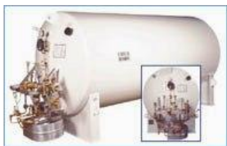
Chart's Horizontal Series bulk stations for liquid nitrogen, oxygen or argon are available in sizes from 1,500 to 15,000 gallons (5,678 to 56,781 liters).

The Chart/MVE plant located at 407 7 th Street N.W. in New Prague, Minnesota, is the MVE founding site and is in its 45 th year of operation. At the company's 240,000-square-foot plant in New Prague, workers manufacture bulk storage tanks, transport tanks and trailers, helium and hydrogen storage tanks, railcars, insulated pipe, nitrogen storage systems, and low temperature storage freezers for the artificial insemination market and the medical research industry. These products are used in many cryogenic applications.